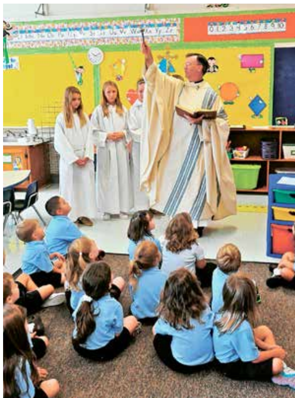
Photo courtesy of The Catholic Standard, Sacred Heart School, Washington, D.C.

In a Catholic school a joyful and Gospel-centered environment enriches the minds, hearts and souls of students and prepares them to grow in their faith and responsibility to live justly. All curriculum and instruction in the Catholic school is permeated with religious and moral values promoted in the Gospels. Students explore their faith through classes, participation in spiritual activities and in Christian service programs. While not all students are Catholic, all are invited to share their experiences and grow in their own moral development. The Catholic school