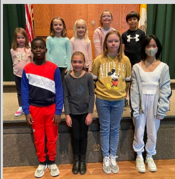
Super Slades Week of 10/03/22-10/07/22

Happy Helpers for the Homeless: A hearty 'thank you' to our 3rd & 4th grade families for your generous 'bag a breakfast' donations to Happy Helpers for the Homeless. Your generosity is much appreciated. We are happy to have had 139 breakfasts to donate this month. Many thanks to the parent volunteer committee for collecting and delivering our 'Bag a Breakfast' donations this morning. We really appreciate all your help!