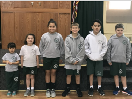
Super Slades Week of 10/01/18-10/05/18

Friday, 10/05/18 —Brown bag lunches donated for Happy Helpers for the Homeless, Gr. 3 & 4; Student Bake Sale