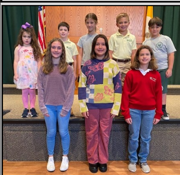
Super Slades Week of 9/26/22-9/30/22