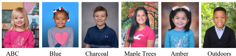
ABC Blue Charcoal Maple Trees Amber Outdoors

Please attach payment to this form or complete online payment or credit card information. DO NOT enclose this form in an envelope.