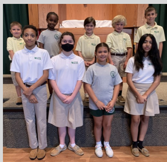
Super Slades Week of 9/19/22-9/23/22