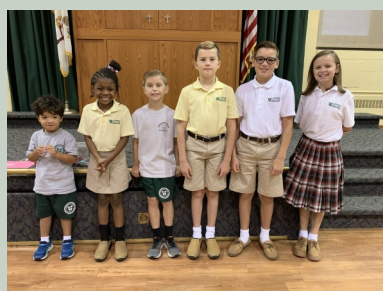
Super Slades Week of 9/16/19-9/20/19

Friday, 9/20/19 —Student Council Rep elections; Skate Night at Wheels in Odenton, 5:45-7:45 p.m., Purchase tickets in advance or at the door (See flyer attached.)