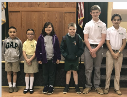
Super Slades Week of 5/01/18

Friday, 5/11/18 —Race for Slade, MSCS Field