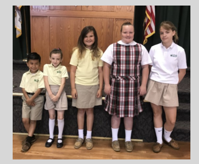
Super Slades Week of 6/03/19—6/07/19

Help the life of one person and you can help the community. ~Steven Sawalick