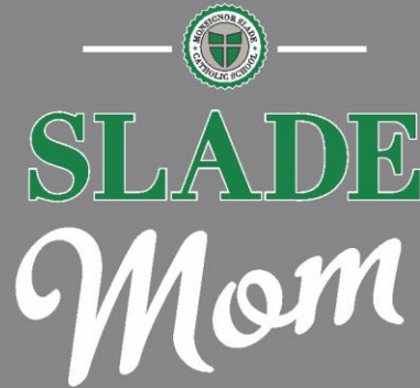
(Front Center Shirt) - 3 Color Print

Monsignor Slade Catholic School - Spirit Apparel Sale - Credit Cards Only. Flash Sale Open APRIL 17th through April 23rd. All Apparel will be ready by about May 8th. Contact kklmcd5@yahoo.com for questions