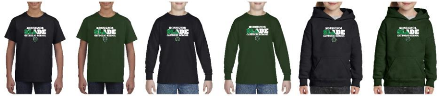
(Front Center Shirt) - 3 Color Screen Print