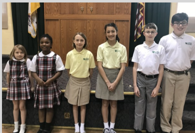
Super Slades Week of 4/16/18

Friday, 4/27/18 —Tuition Assistance Out-of-Uniform Day fundraiser, $2 per student; Interims distributed for Pre-K3—Gr. 2