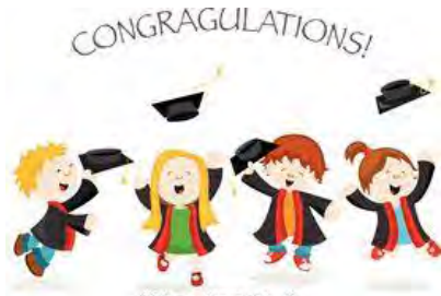
Graduation Gifts

The Scrip Program is a great way to buy gifts for