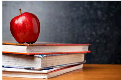
End of School Teacher Gifts