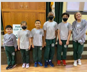
Super Slades Week of 4/04/22-4/08/22