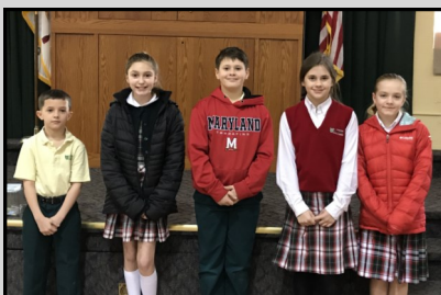
Super Slades Week of 3/05/18

Saturday, 3/17/18 —Spring musi- cal— Sound of Music , 1 & 7 p.m., Auditorium