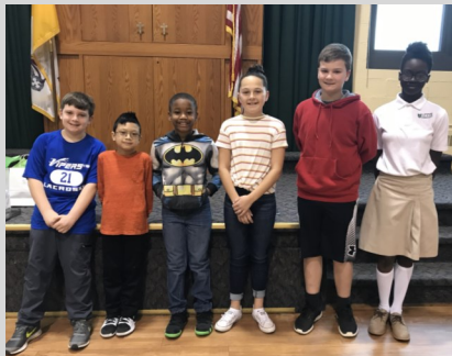
Super Slades Week of 4/01/19-4/05/19