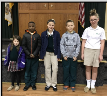
Super Slades Week of 3/19/18