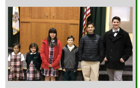
Super Slades Week of 3/12/18

Friday, 3/23/18 —Tuition Assistance Out-of-Uniform Day fundraiser, $2 per student; Skate Nigh at Wheels in Odenton, 5:45-7:45 p.m.