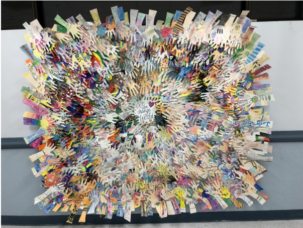
Students worked together in art class on a collaborative art piece of each student's hand that was individually decorated.