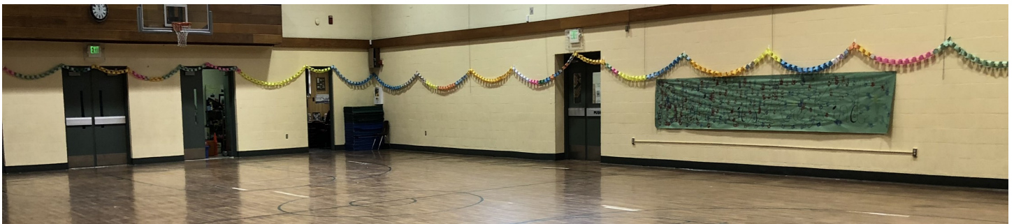
Whenever a kind act was witnessed, students and faculty would write the act on a strip of paper. Those strips became a chain that wrapped around half of the gym!

Over 7,506 acts of kindness were performed in 5 days by our students!