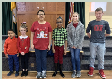
Super Slades Week of 12/20/19-1/10/20

Please note: This is the last issue of the weekly update for 2019. Then next parent update will be sent home on January 10, 2020.