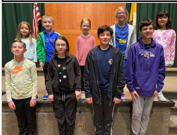
Super Slades Week of 12/19/22-1/06/23