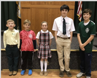
Super Slades Week of 12/17/18-12/21/18

Friday, 12/21/18 —Christmas holidays begin, HALF-DAY, Dismissal 12:15 p.m.; Out-of-uniform day, students may wear red & green or Christmas attire