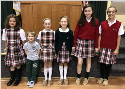
Super Slades Week of 11/12/18-11/16/18

Friday, 11/16/18 —Skate Night at Wheels in Odenton, 5:45-7:45 p.m.