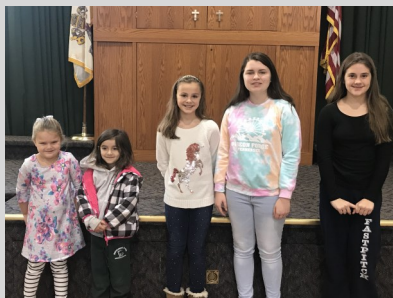
Super Slades Week of 12/03/18-12/07/18

Showchoir Performance: Slade's Showchoir will be performing at the Ferndale Community Christmas Tree Lighting ceremony on December 4th, from 6:00-6:15 p.m. at Michael J. Wagner Recreation field. Rain date is December 5th. Please come out and show your support for the choir.