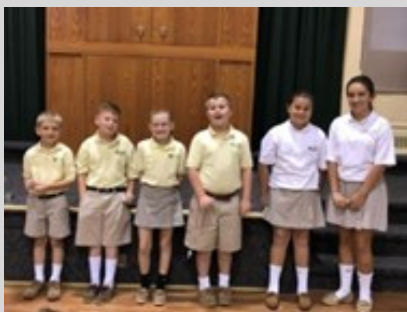
Super Slades Week of 10/09/18-10/12/18

Friday, 10/12/18— Interim Reports mailed to parents of students in Pre-K3 through Grade 2