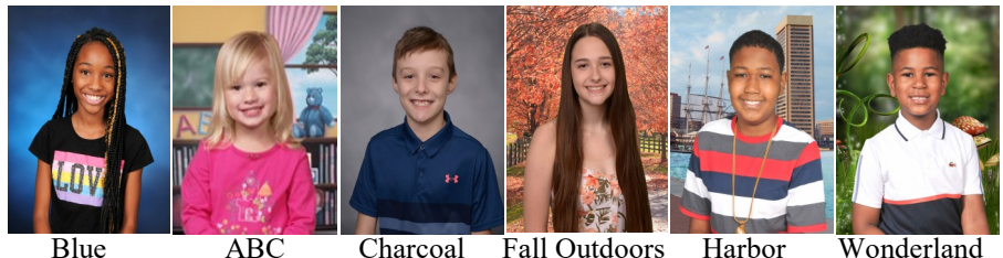
Blue ABC Charcoal Fall Outdoors Harbor Wonderland