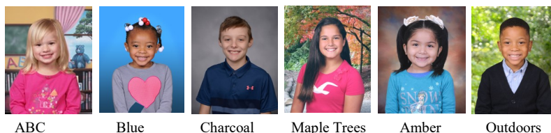
ABC Blue Charcoal Maple Trees Amber Outdoors

Please attach payment to this form or complete online payment or credit card information. DO NOT enclose this form in an envelope.