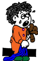
THE DEFIANT CHILD