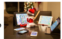
Busy technology elf!

Over this year's Christmas break, as Monsignor Slade students and staff took time to enjoy the holidays, the technology elves were hard at work making significant upgrades to the technology infrastructure throughout the school.