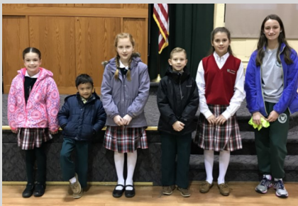
Super Slades Week of 1/16/18

Friday, 1/26/18—Out-of-Uniform Day to support Tuition Assistance Program—$2 per student