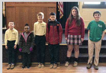
Super Slades Week of 1/28/19-2/01/19

"Give your hands to serve and your hearts to love." ~Mother Teresa