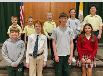
Super Slades Week of 1/17/23-1/20/23