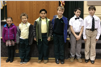
Super Slades Week of 1/08/18

Friday, 1/19/18—Interims distributed, Grades Pre-K3—2; Skate Night at Wheels in Odenton, 5:45-7:45pm