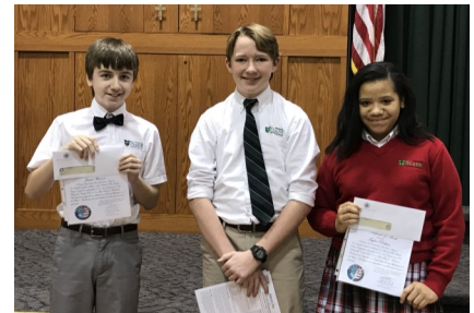
Congratulations on a job well done!

Sunday, 1/28—Open House for Prospective Parents Monday, 1/29—Catholic Schools Day Tuesday, 1/30—Slade Day Wednesday, 1/31—Faculty & Staff Appreciation Day Thursday, 2/01—Parent Appreciation Day Friday, 2/02—Student Appreciation Day